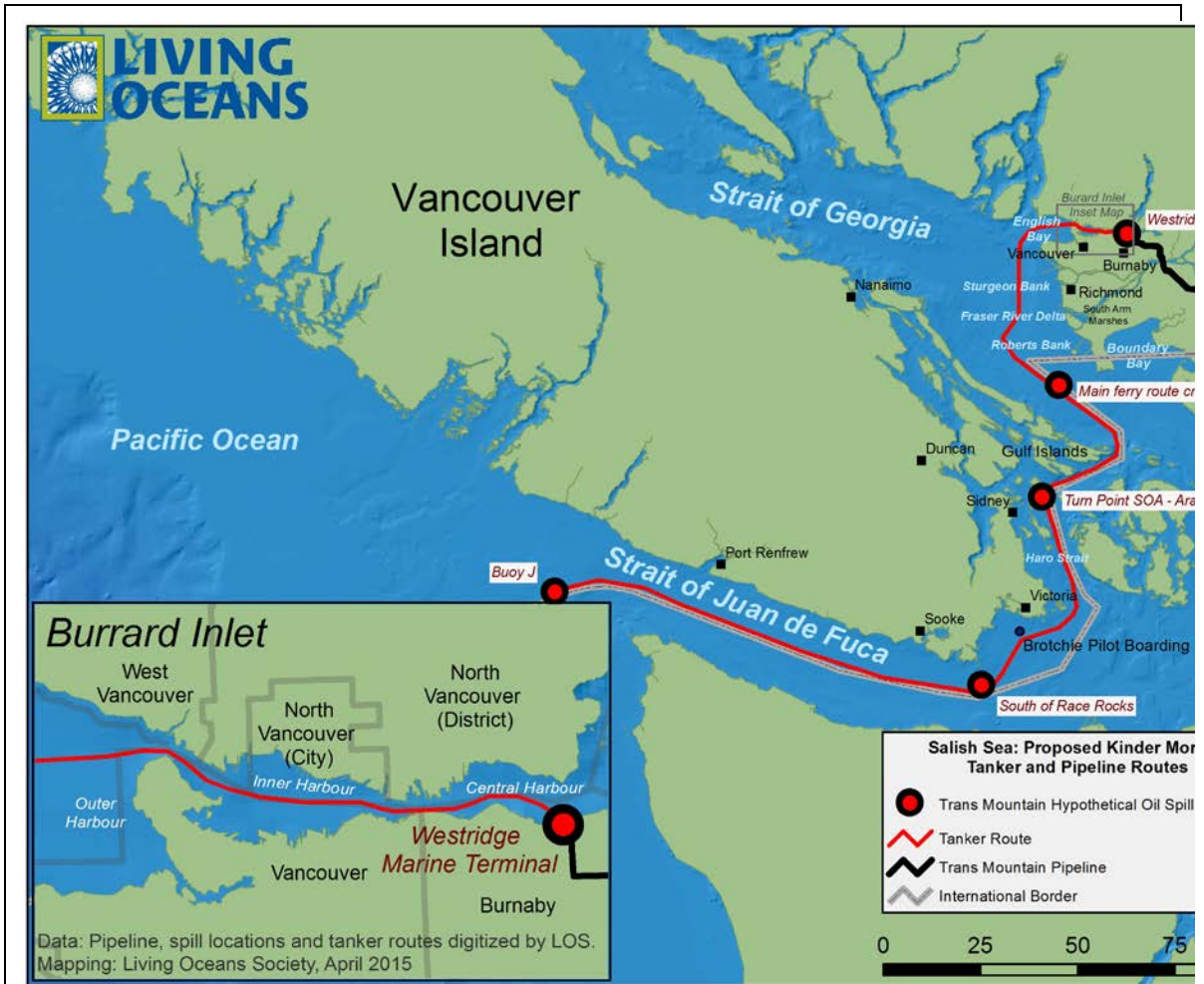
Figure 1. Salish Sea, including Burrard Inlet, the Westridge Marine Terminal, Sturgeon Bank, South Arm marshes, Robert's Bank, Boundary Bay, the tanker route, Haro Strait, and the oil spill origin locations selected for the oil spill trajectory models presented in the Trans Mountain ERA.